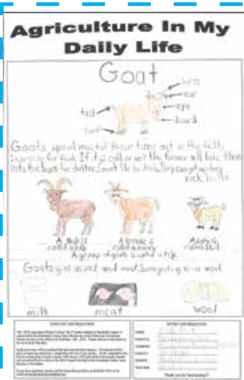
First Place: County Winner Libby Park