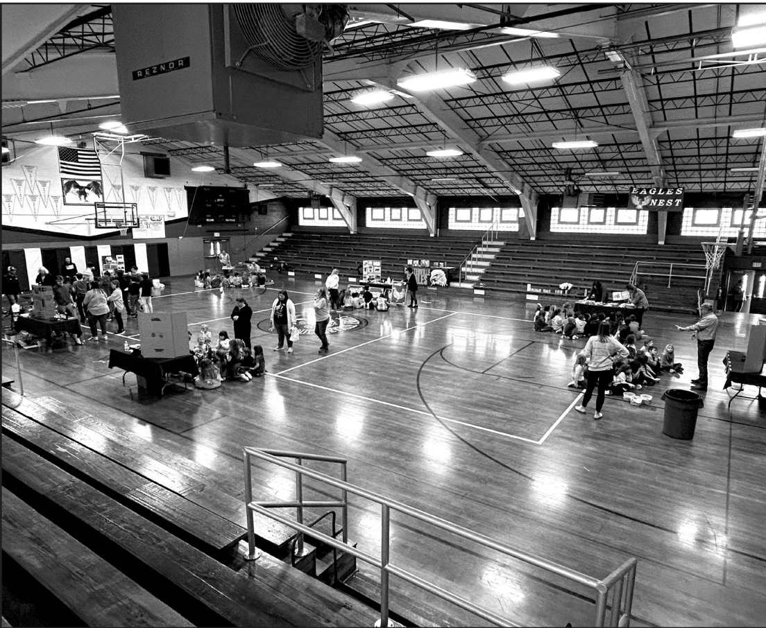
Coulterville Elementary School

The RCFB Ag in the Classroom program hosted an Ag Expo at Coulterville Elementary on Friday, March 1st. All classrooms in the school attended. The presenters in the seven booths are volunteers that shared their