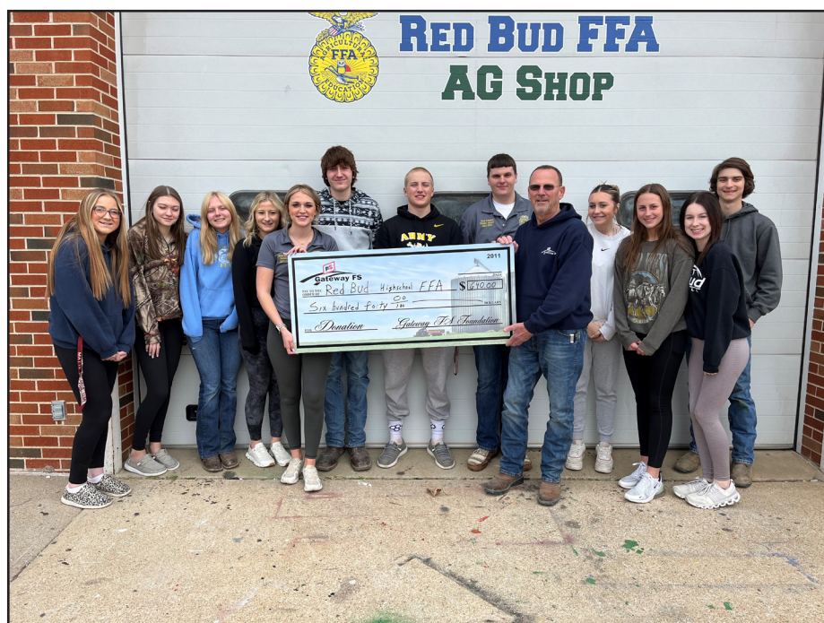
Red Bud High School FFA

Gateway FS just finished our Fuel Our Futures Campaign that ran for the month of