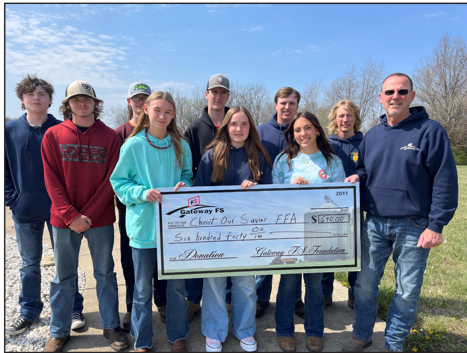
Christ Our Savior FFA