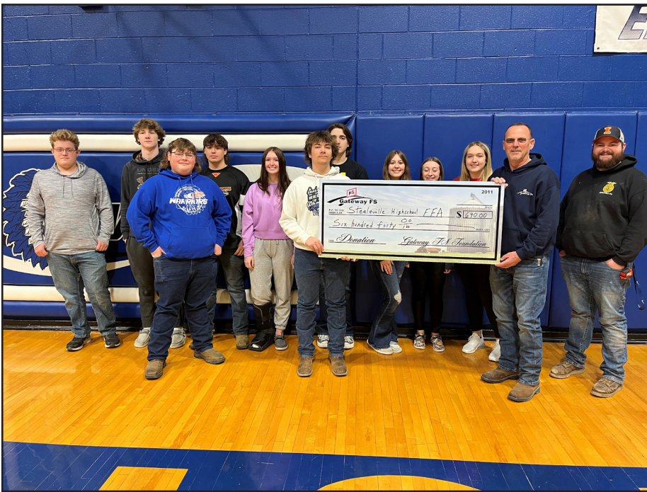
Steeleville High School FFA