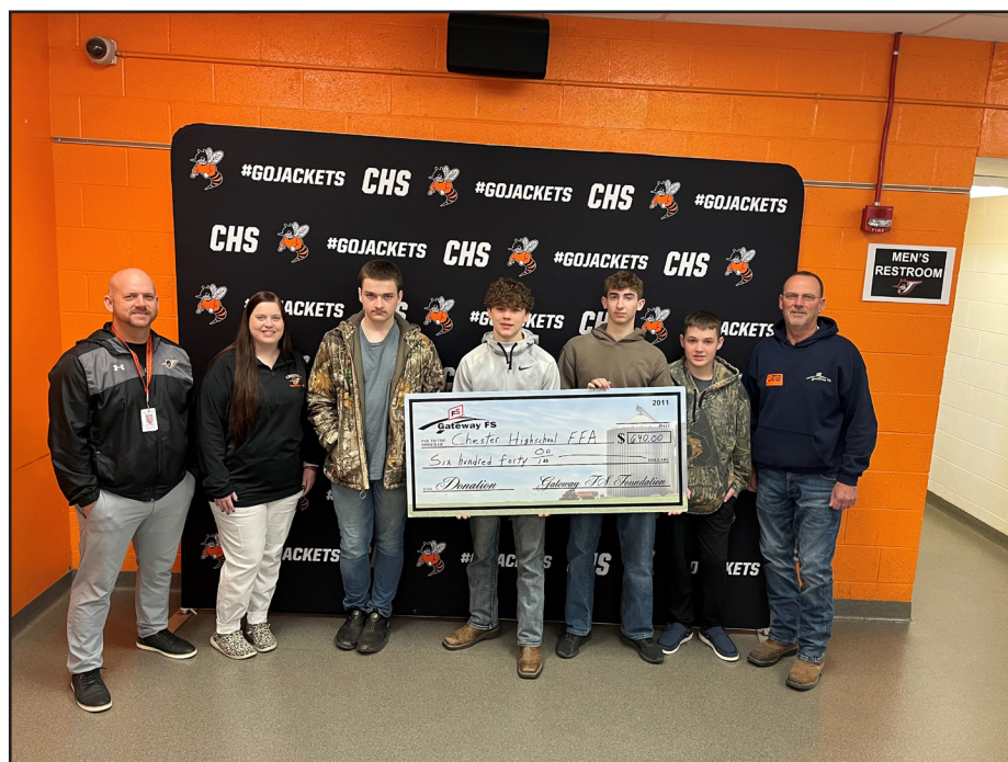
Chester High School FFA